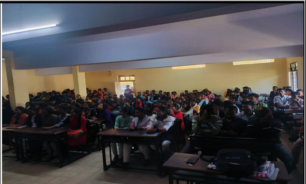
with the Participants